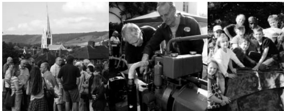
Hidden Behind the High Street Walk

Open: Thursday & Friday 13.30 - 15.30; no booking required.