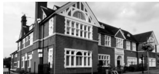
Letherhead Institute, Leatherhead

Pre-booking essential via Dorking Halls, see page 2 for details.