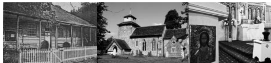
Providence Chapel, Charlwood

Open: Saturday 10.00 - 16.00, Sunday 10.30 - 12.00 & 18.00 - 19.30; no booking required.