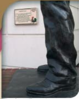
Vaughn Williams Statue