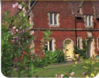
The Cotmandene Almshouses