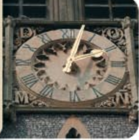
St Martin's Church Clock