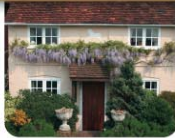
A Cotmandene Cottage

where the telephone exchange is now. Outside the Dorking Halls 5 a bronze statue at the entrance to the Halls celebrates the composer Ralph Vaughan Williams who lived in Dorking. Within the Halls a beautiful bronze relief also depicts the composer.